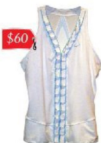
Allegro Top Designer: Karma Athletics Shop: Karma Athletics Address: 2066 W. 4th Ave. karmaathletics.com