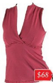
Strap Tank Designer: lululemon Shop: lululemon Address: Various Locations lululemon.com