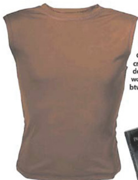
This breathable, wrinkle-proof T-shirt by Karma Athletics (karmaathletics.com) is made using enviro-friendly ChitoSante — fashioned from crab and shrimp shells (and it's a dead ringer for the version Sting wore on stage at the Grammy's, btw). At Karma Athletics, $30.