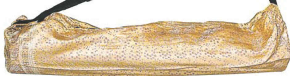
Carry your jute yoga mat in style. Alchemy tote ($24.99) at Semperviva.