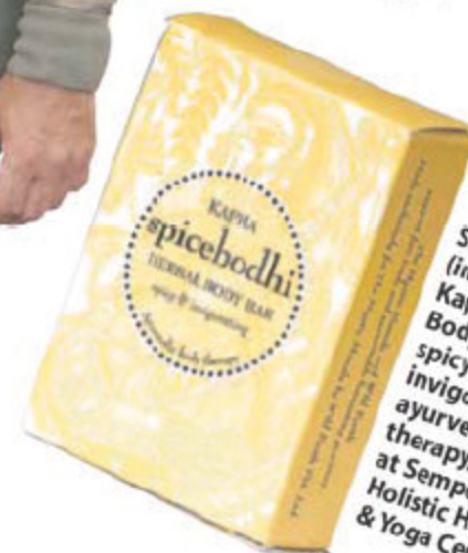
Smells healthy (in a good way). Kapha Herbal Body Bar is spicy and invigorating ayurvedic body therapy, $7.99 at Semperviva Holistic Health & Yoga Centre.