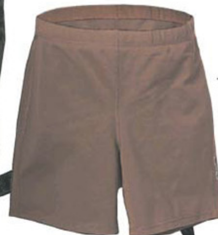
These ChitoSante shorts have anti-bacterial properties and are super soft, to boot. At Karma Athletics, $40.