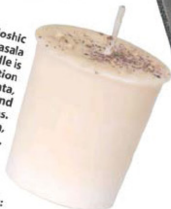
This Tridoshic mystic masala votive candle is a combination of the Vata, Pitta and Kapha doshas. At Semperviva, $2.99 each.